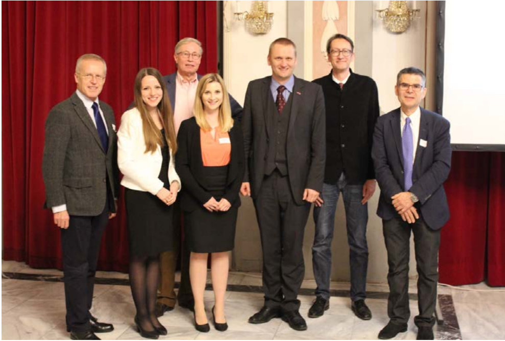
Organizers and Presenters of the Opening-Event